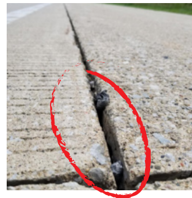
ROD & SILICONE